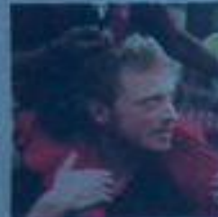
See his work at the L.A. Times' California Pavilion, Booth 47.

For more on this year's winners, visit www.latimes.com/festivalofbooks